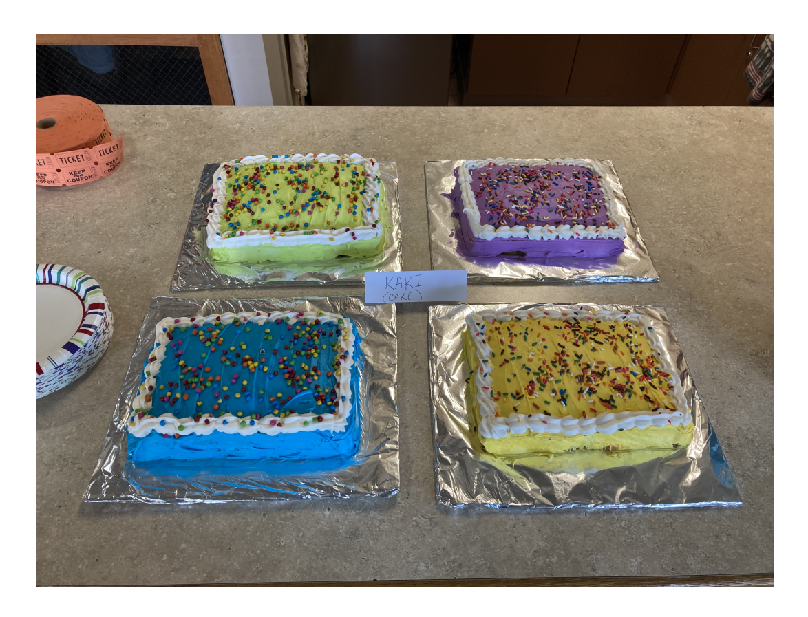
explanatory We so enjoyed spending time with family and friends! We

Here are a few additional pictures of our time in the U.S. Most of them are self