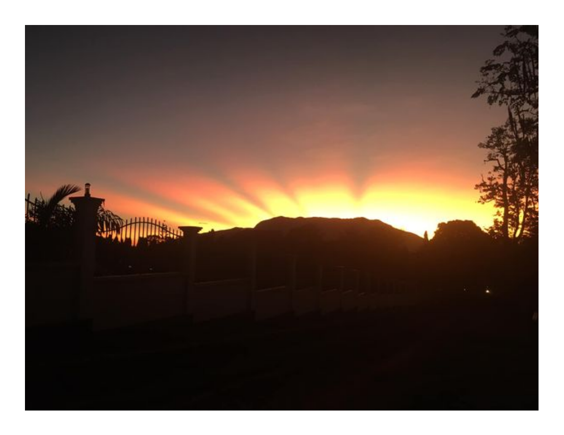
Ah, Sovereign Lord, you have made the heavens and the earth by your great power and outstretched arm. Nothing is too hard for you. Jeremiah 32:17