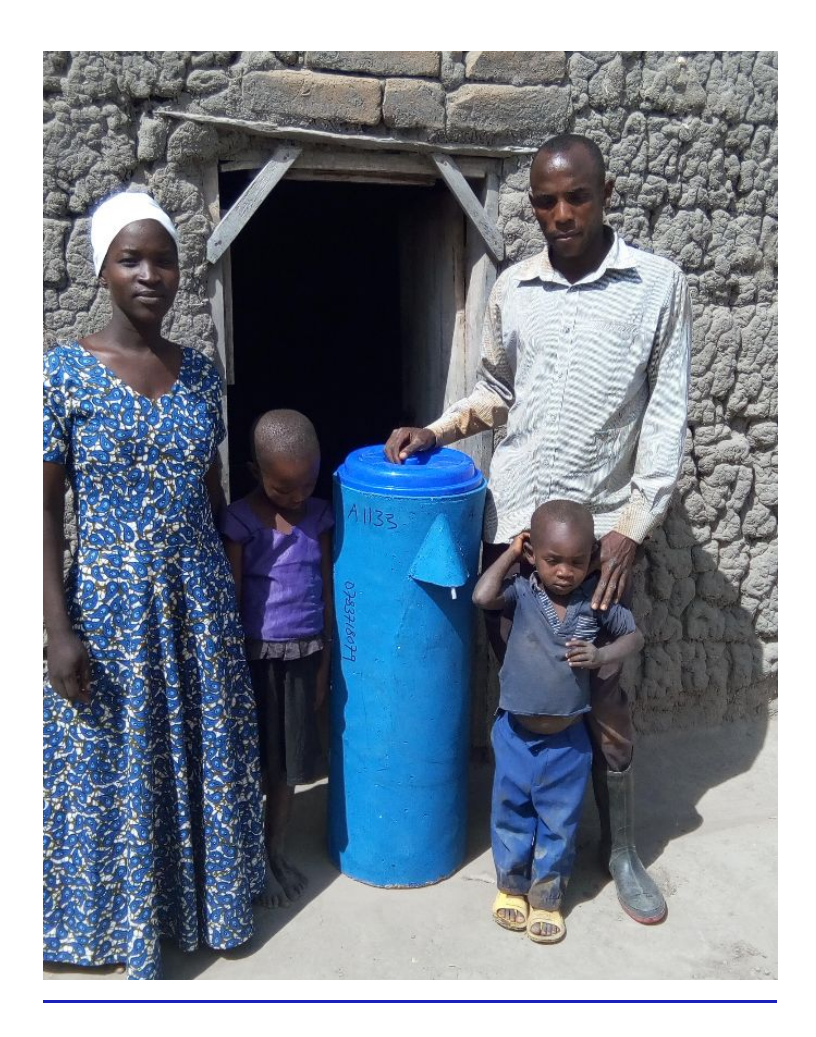
The prayers of a righteous man are powerful & effective! Please commit to praying with us.......